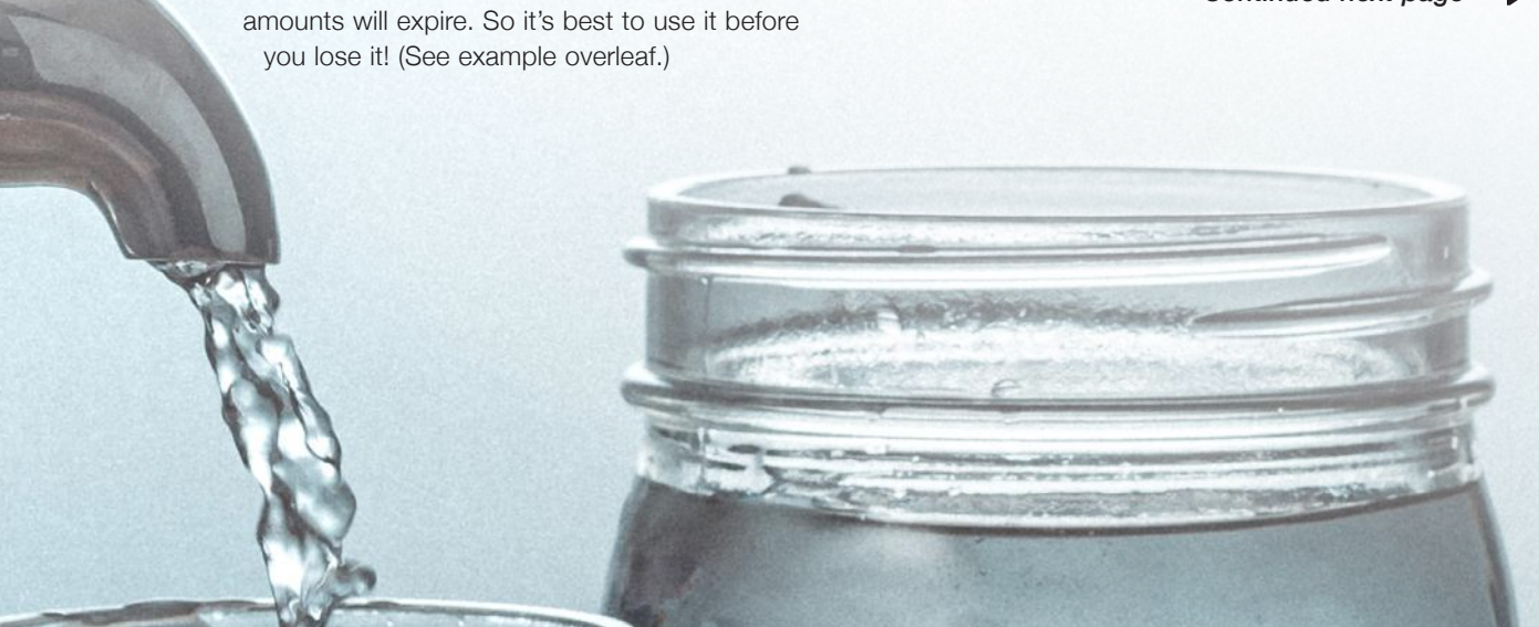
February 2022 | www.wallacepartners.com.au | 5